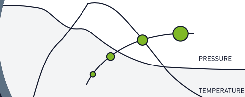
Emulsion Detonation Synthesis (EDS)